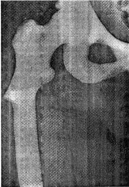
FIG. 1. — Subtrochanteric fracture of the right femur.